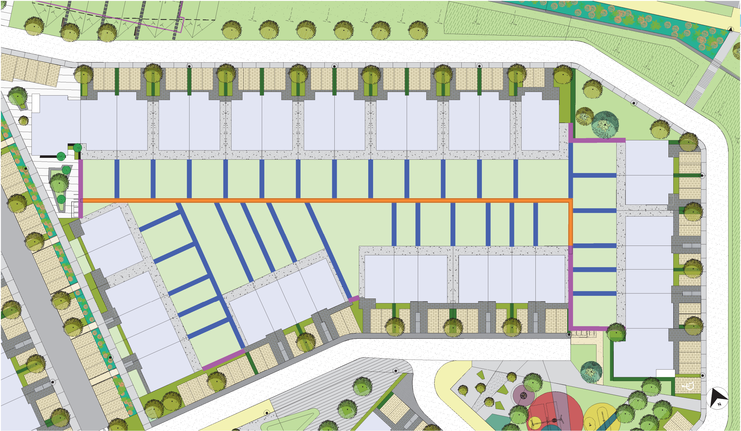
TYPICAL BOUNDARY TREATMENT SCALE: 1:500 @ A3