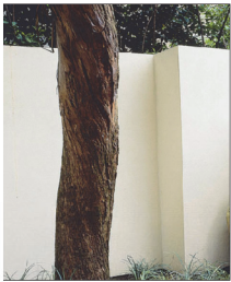
Retaining wall between rear gardens 2000mm high rendered concrete blockwork wall