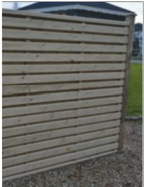
Internal garden boundaries: 1800mm high concrete post and plinth fence with infill timber panel. Horizontal panelling to match louvre detail at gable ends.