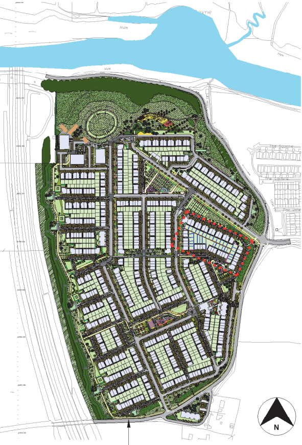
KEY PLAN SCALE: NTS

Soft landscape treatment used around perimeter of the site