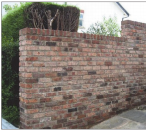
Rear garden gable end walls: 2000mm high brick wall (to match adjacent property) and capping with louvred timber fence detail on top and within the wall adjacent to public realm and the street.